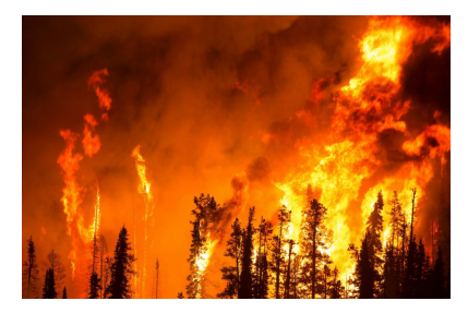
Fire Season is Coming

Grants are available to help you stay in compliance with the fire departments and to make your property safer from wildfires. If you didn't receive, or can't find, your Defensible Space Inspection Report please apply or call MWPA (415) 275-1185 (if in County) or click here or call 415-485-3054 (if in San Rafael).